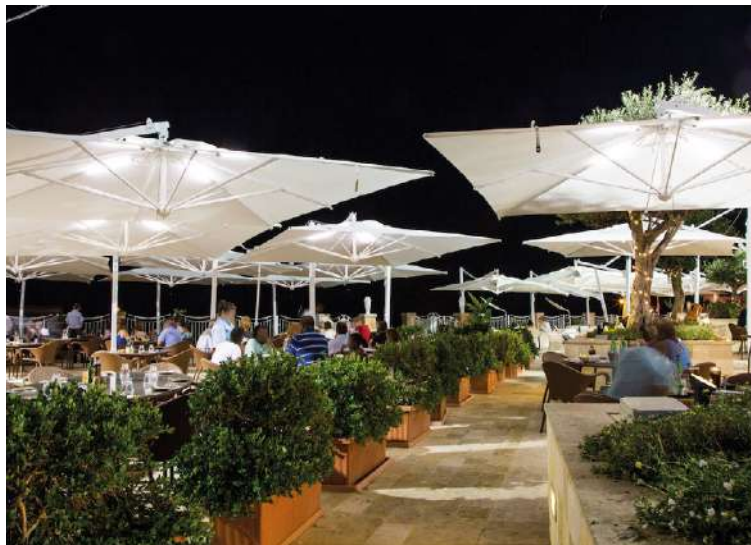
RADISSON HOTEL MALTA